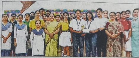
समारोह के दौरान स्टूडेंट्स और स्कूल स्टाफ।

प्रतियोगिता में पोस्टर मेकिंग, बेस्ट आउट ऑफ वेस्ट और मुक्तिकला जैसी श्रेणियों में विद्यार्थियों ने भाग लिया। बच्चों ने सामाजिक संदेश, पर्यावरण